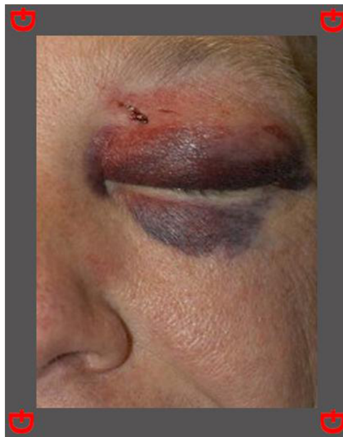
Figure 1. Example of a negative picture with symbol used in the peripheral memory test.

The PMT consisted of three practice trials and 20 test trials (10 with a neutral and 10 with a negative picture). Children were instructed to take a good look at the whole picture, including the frame, and were asked to try to remember everything. They were also warned that the picture would be presented only for a short time. As can be seen in Figure 2, a fixation cross was presented first for 500 ms. Next, the target picture plus the frame with symbols was presented for 1 s, followed by a black screen for 10 s. Afterwards, the original target picture was presented together with three similar distractor pictures. The child had to identify the correct picture by entering the number corresponding to the picture (1, 2, 3, 4). Next, the same procedure was followed for the symbol in which the correct orientation of the symbol (left, right, up, down) had to be chosen. Within each trial, the order of the forced choice recognition of the central and peripheral components was random –sometimes the central components were presented first and at other times the peripheral components were presented first. The intertrial interval was 2 s. The order of the test trials was also random. The PMT was run using the Inquisit 3 program.